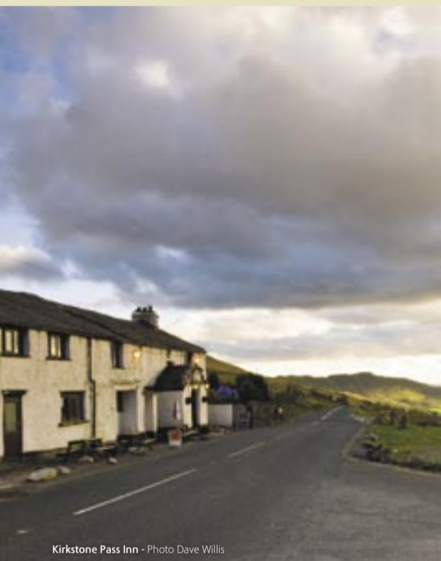
Kirkstone Pass Inn

You can also take a trip to Lakeside, taking the 11.40 boat, arriving at 12.20. You have time for lunch or a ride on the Lakeside and Haverthwaite steam railway, before catching the 14.40 boat back to Bowness. Take the 16.10 Kirkstone Rambler back to Glenridding.